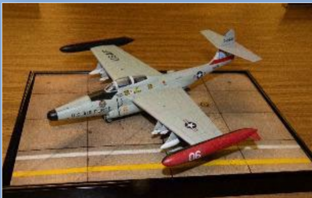
Aircraft 1/72, 1 st Place F-89 by Jim Fitzgibbon