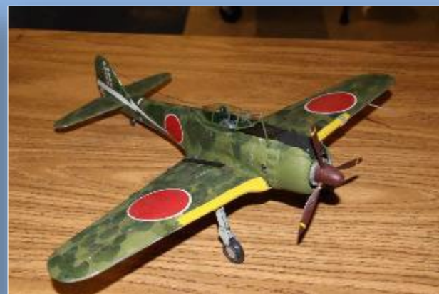
1/48 Ki-43 by Walter Schlueter