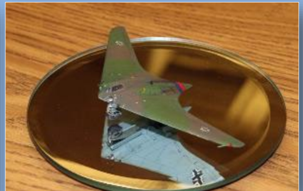
Aircraft 1/72, 2 nd Place Ho-229 by Ed Mautner