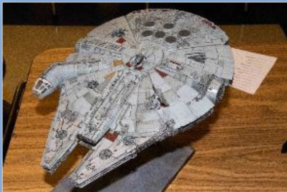
Sci-Fi, 1 st Place Millenium Falcon by Isobel Nylander