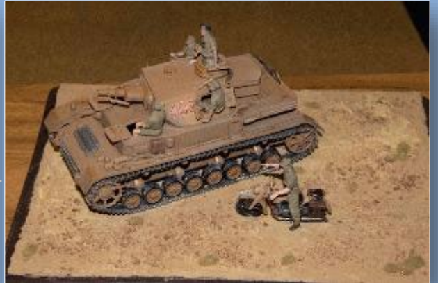
1/735 Panzer IV by Isobel Nylander