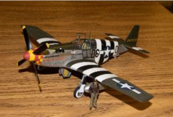
1/72 P-51B by Vivian Watts?