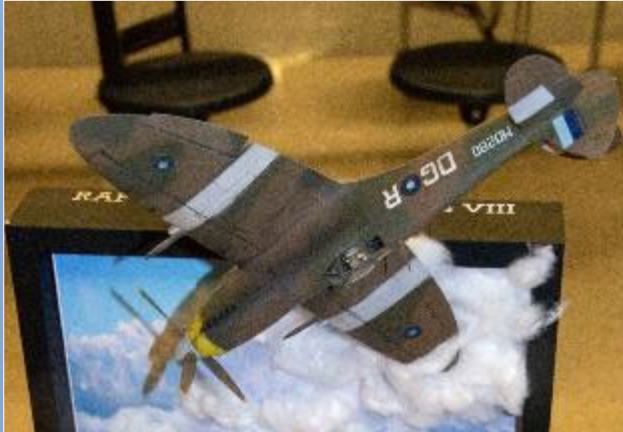
Best of 2024, 2 nd Place 1/48 Spitfire by Bryan Nylander