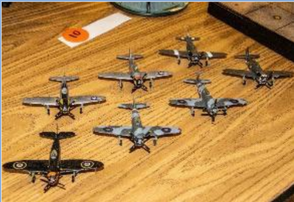
1/144 P-47 Collection by Vince Mankowski