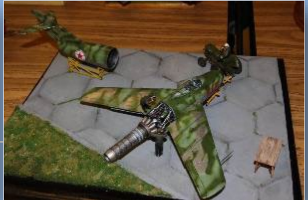
Aircraft 1/48-32, 2 nd Place MiG-15 by Scott Bricker