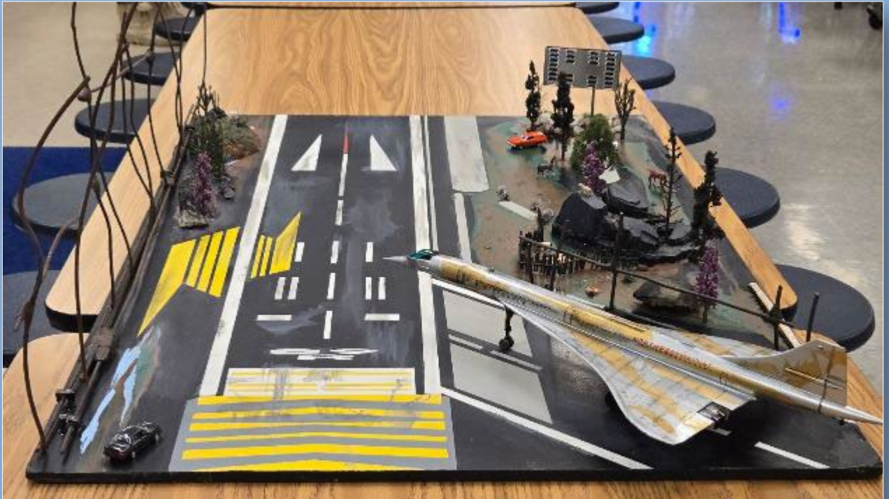
1/144 Russian SST Diorama