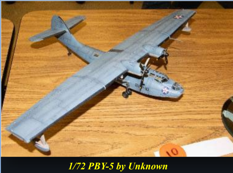
1/72 PB5-C by Unknown