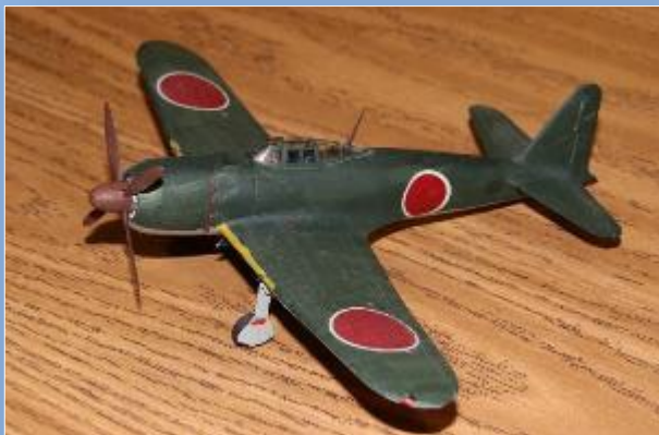
1/48 A7MA Reppu by Walter Schlueter