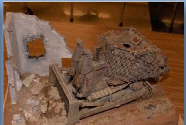
Best of 2024, 1 st Place 1/35 Israeli Dozer by Rafy Levy