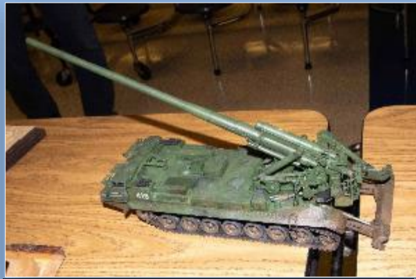
1/35 257mm Pion 35-M by Christenson