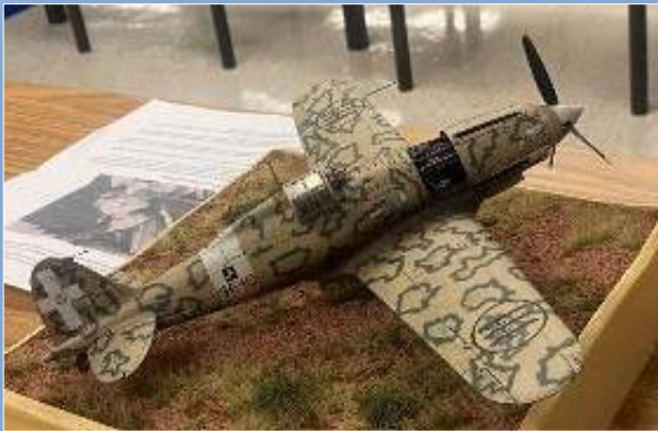
Aircraft 1/48-32, 1 st Place Machi MC-202 by Wes Shull