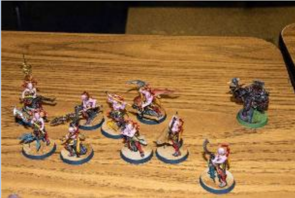
Sci-Fi Figures by Jon DeSalva?