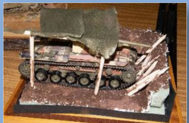
1/35 Hidden from Plain Sight Diorama by Unknown