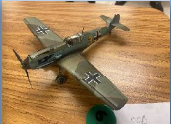
Best out of the Box X-Wing by Darren Riggs