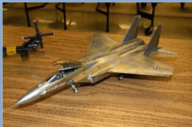
1/48 F-15A Streak Eagle by Nelson Kee