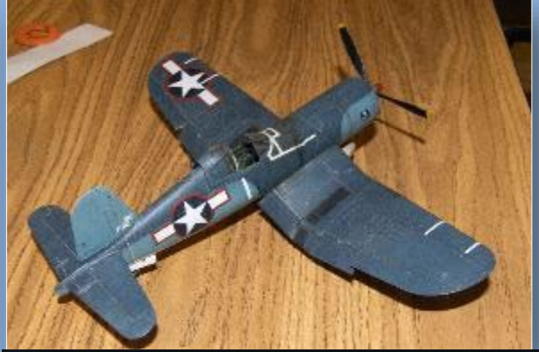
Special, 2 nd Place 1/48 Corsair by Wes Shull