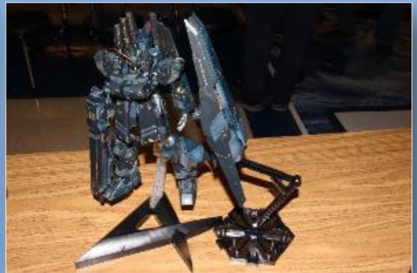
Sci-Fi, 2 nd Place HU Gundam HWS by Bee Vetter