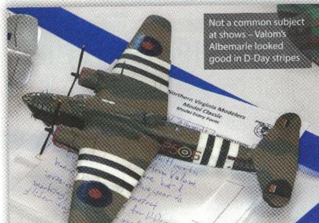
Not a common subject at shows - Valom's Albemarle looked good in D-Day stripes