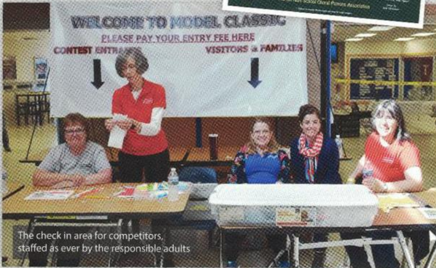
The check in area for competitors, staffed as ever by the responsible adults