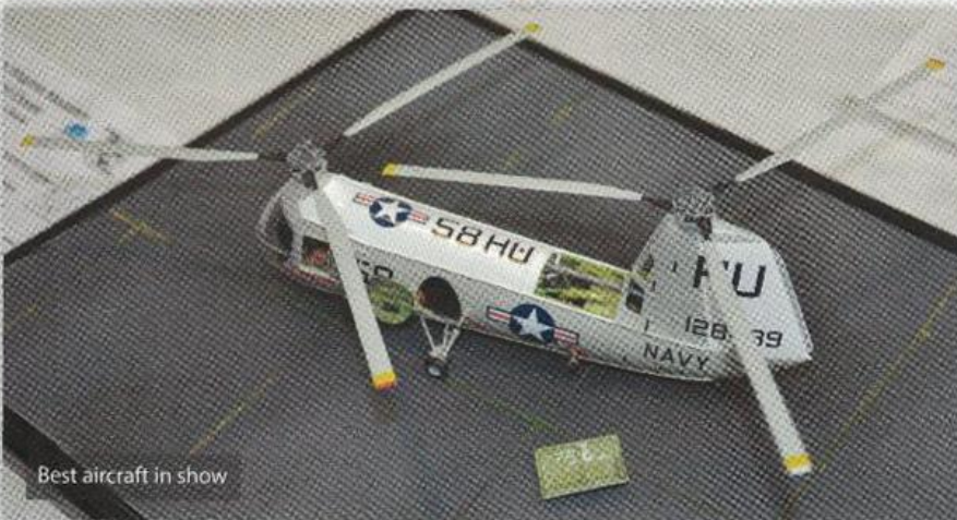
Best aircraft in show