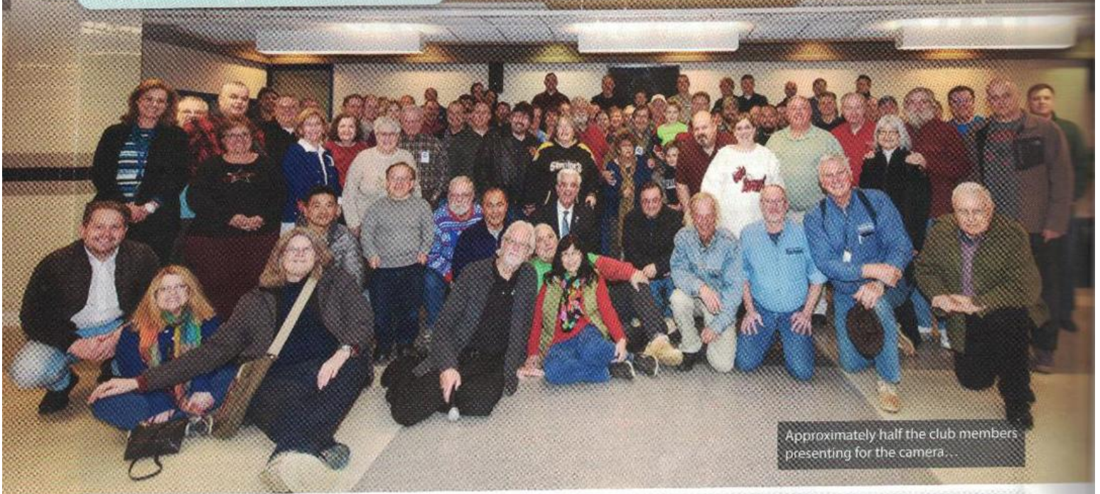
Approximately half the club members presenting for the camera...

On April 20, 2019 the Northern Virginia chapter of IPMS USA reached new heights with the Northern Virginia Model Classic held at Fairfax High School. We set new records in numbers of models competing, and attendance with a total attendance just shy of 1000 people. This year's theme was 'D-Day to the Bulge' and for a one-day show, with 588 models competing and close to 60 vendors we have now exceeded some large regional IPMS-USA events. This was a major milestone for our chapter. For those who may not be familiar with how the competition is in the US, it is individual versus individual instead of club versus club, with competition in nearly 100 categories.