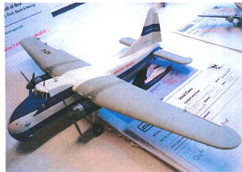
↖ Airfix Bristol Freighter in 1/72 out of the box