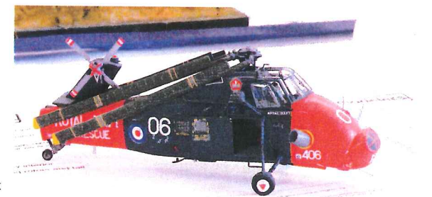
↖ Italeri's Wessex in 1/72