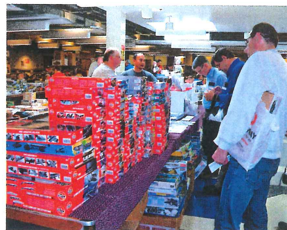
↖ Forty traders were present at a busy and enjoyable show