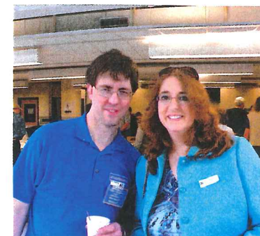
↖ This show report is brought to you by our own correspondent...