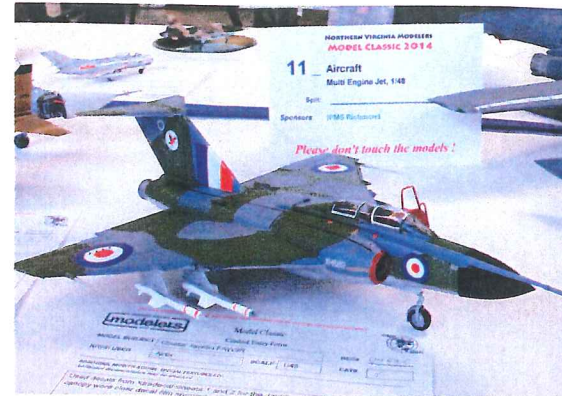
↖ Airfix Javelin 1n 1/48 with Xtradecals to replace the kit items