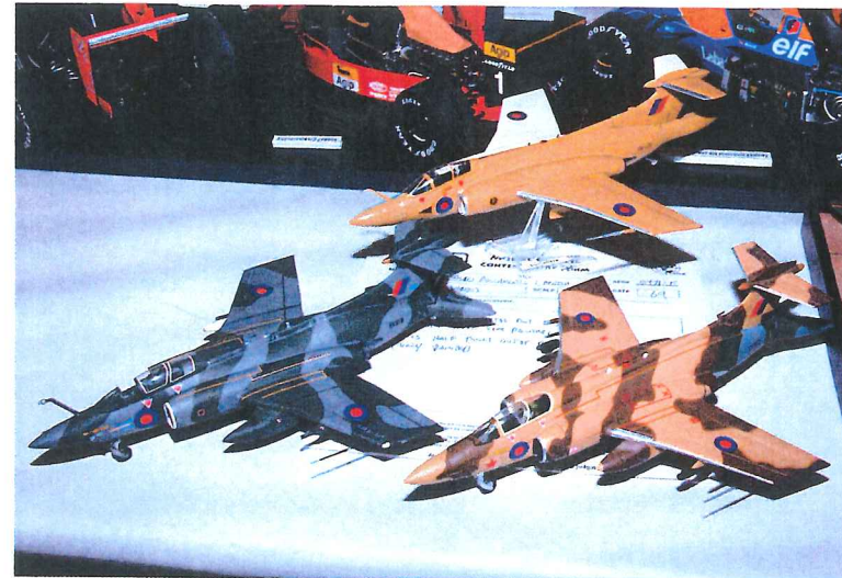
↖ A tidy trio of Buccaneers