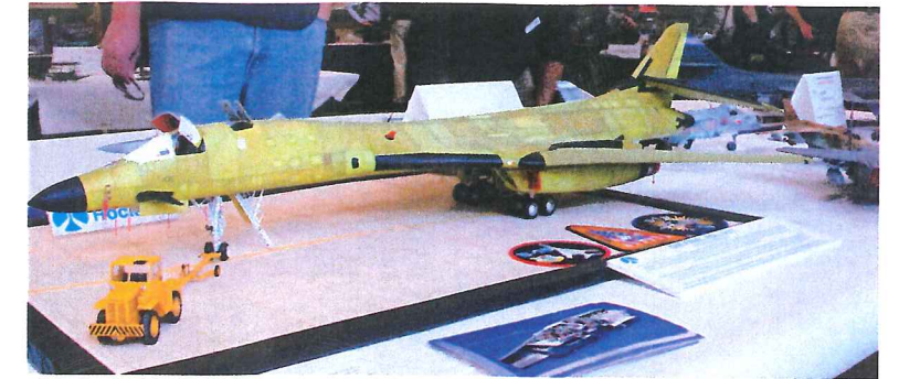
↖ Stunning Lancer in 1/48