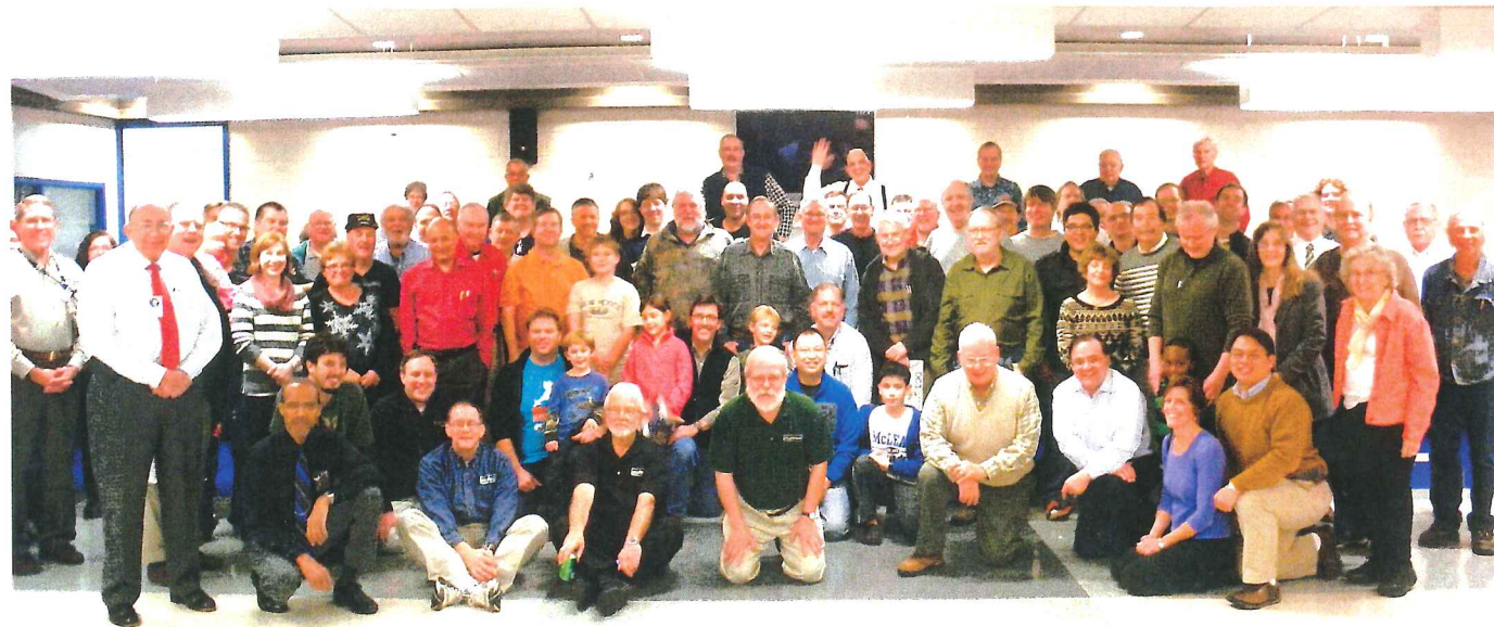
Some of the 200+ Club members at the show