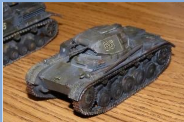
1/35 Panzer II by Evan Frulla