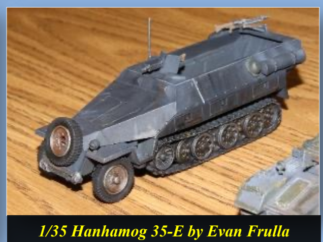
1/35 Hanhamog 35-E by Evan Frulla