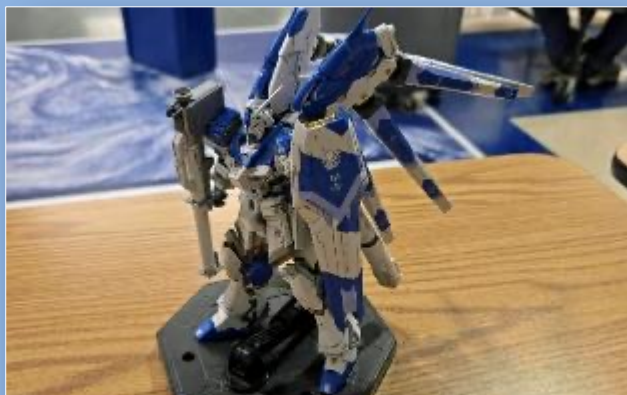
Sci-Fi, 1 st Place HI-NU by Beatrice Vetter