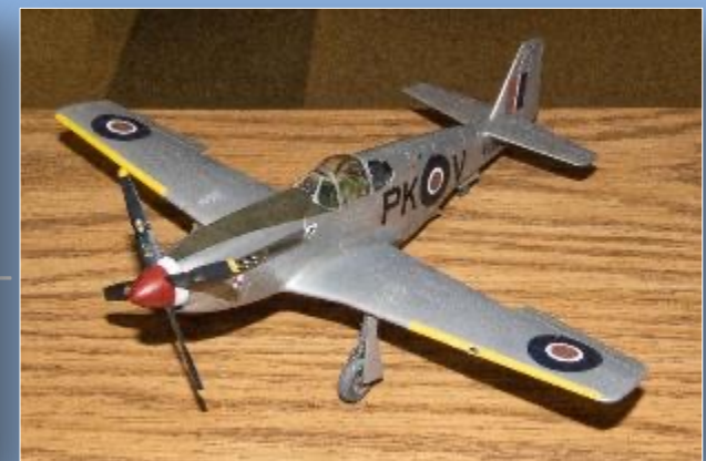
1/48 P-51 by Khurran