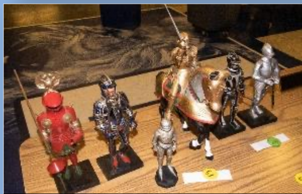
Figures, 1 st Place Aurora Nights by Mike Snyder