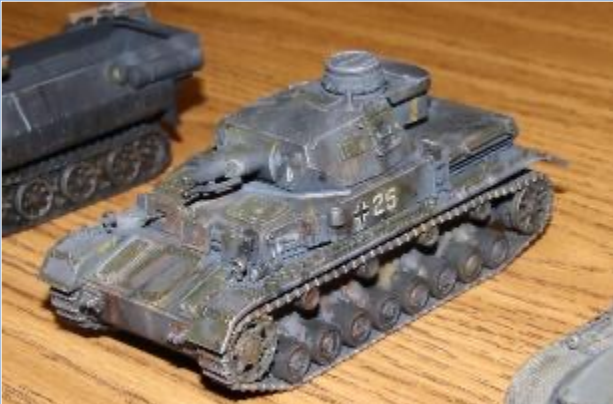
1/35 Panzer V by Evan Frulla