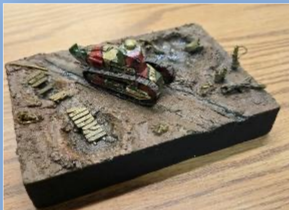
Military Vehicles 1/72, 1 st Place FT-17 by Jesse