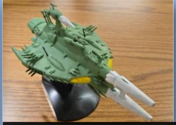
Star blazers ship by Walter Schlueter