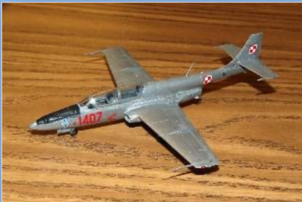
1/72 TS-11 Iskra by Walter Schlueter