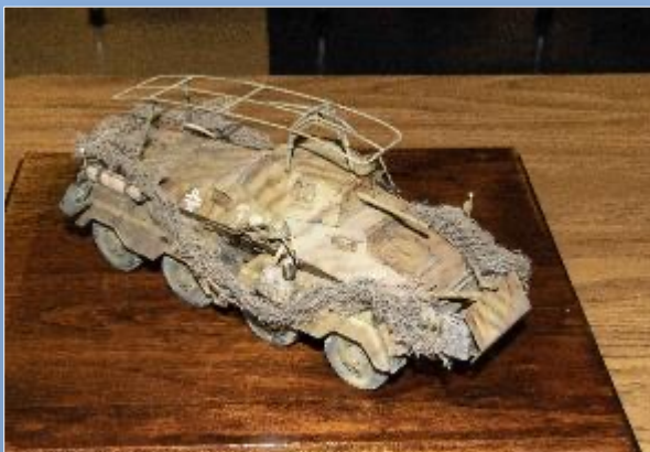
Military Vehicles 1/35, 1 st Place SdKFZ-232 by Charles Locke