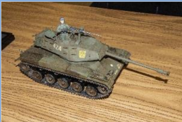
1/35 M-41 by Cody