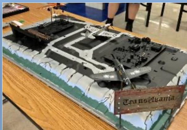
Aircraft 1/72, 2 nd Place P-39 Diorama by Unknown