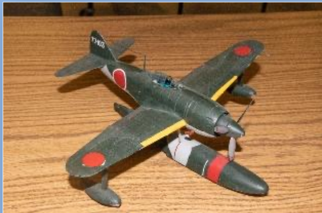
1/48 N1K1 Rex by Walter Schlueter