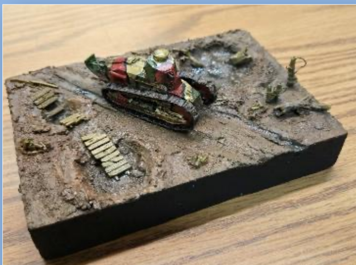
Best Out of the Box FT-17 by Evan Frulla