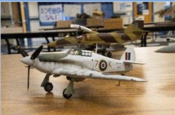
Aircraft 1/48, 2 nd Place Sea Hurricane by Trystan Bennet