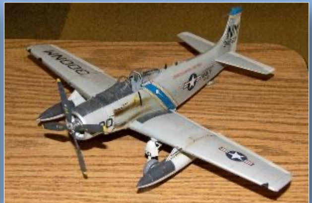
1/72 TS-11 Iskra by Walter Schlueter