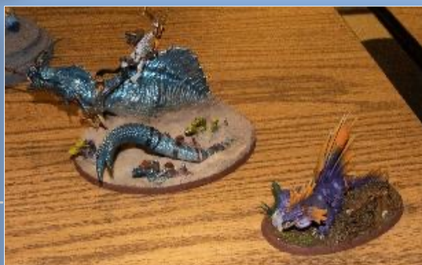
Figures, 2 nd Place Troglodon by Jon DeSalva