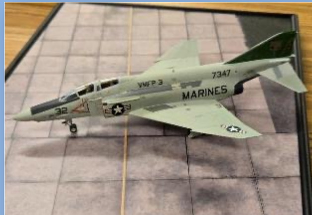
1/72 Phantom by Jim Fitzgibbon