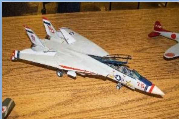
Special, 1 st Place 1/48 F-14 by Dale Hutchinson