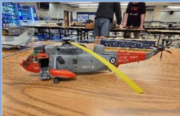
Aircraft 1/48, 1 st Place Sea King by Dale Hutchinson