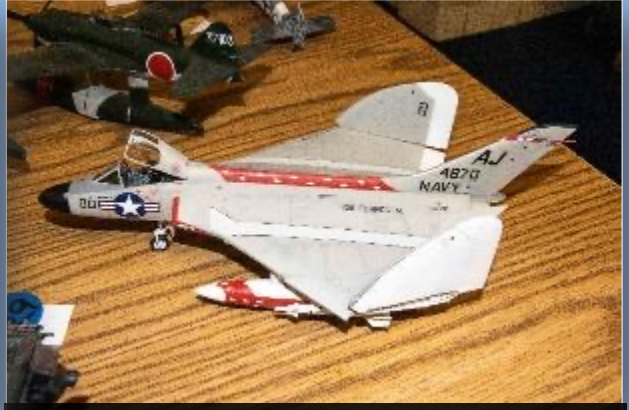
1/48 F4D by Jim Rotramel