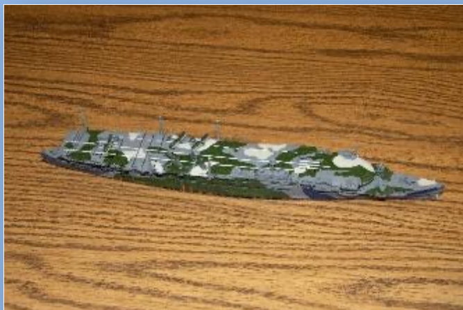
Ships, 1 st Place HMS Furious by Dennis Forrest