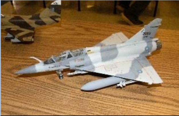
1/48 Mirage by Walter Schlueter