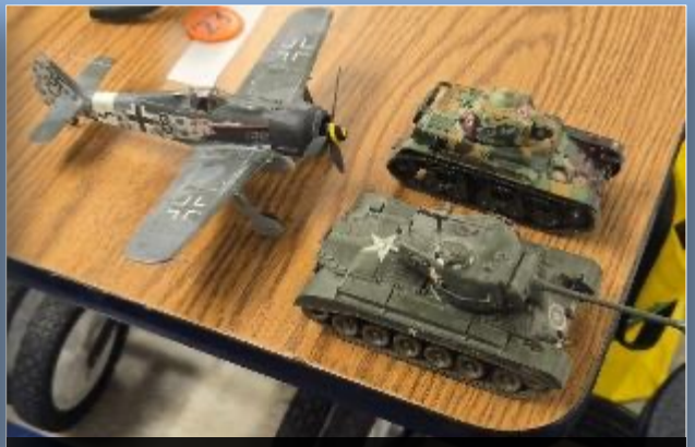
Model Trio by unknown