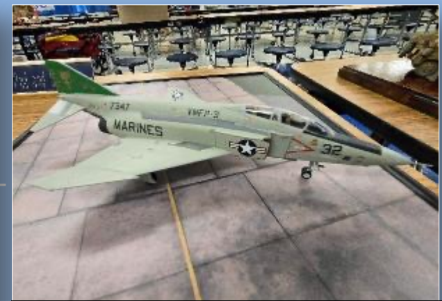
1/72 Phantom by Jim Fitzgibbon