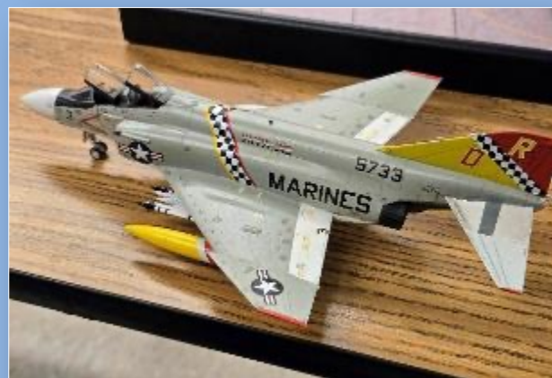
Aircraft 1/72, 1 st Place F-4J by Jim Fitzgibbon