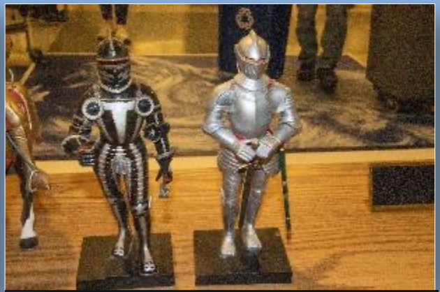
Knights by unknown