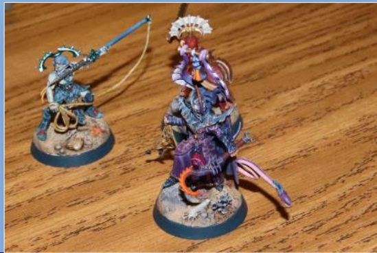
Figures, 1 st Place Idoneth Harrows Deep by Jon DeSalva