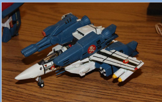
VF-1 Vertech 100 by Dennis Forrest