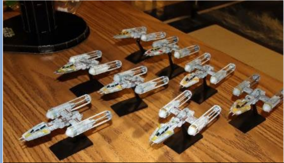
Sci-Fi, 1 st Place Y-wings of Gold Squadron by Ben Hardaway