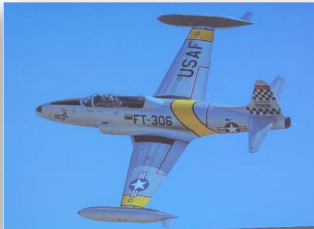
Haagen's Presentation on the October 2022 airshow at Edwards Air Force Base