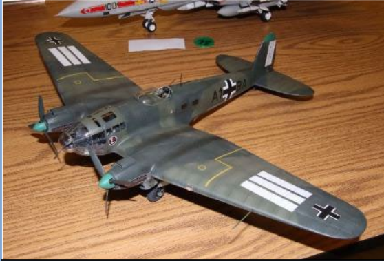
Master, 1 st Place He-111 by Leighton Greenstreet