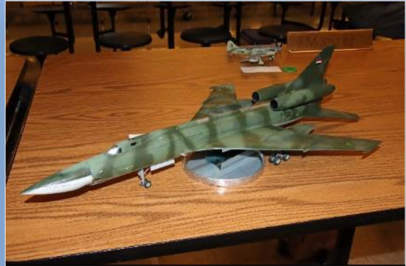
Master, 2 nd Place Tu-22 by Charles Locke