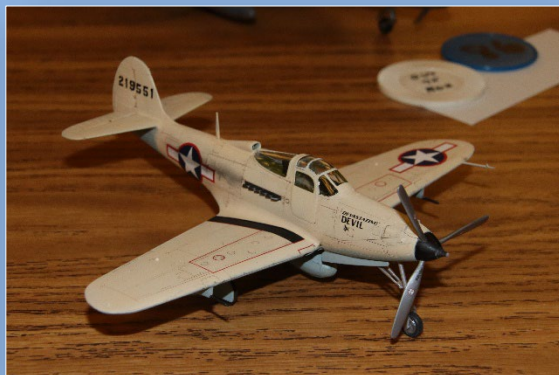
P-39Q, I think it is 1/72