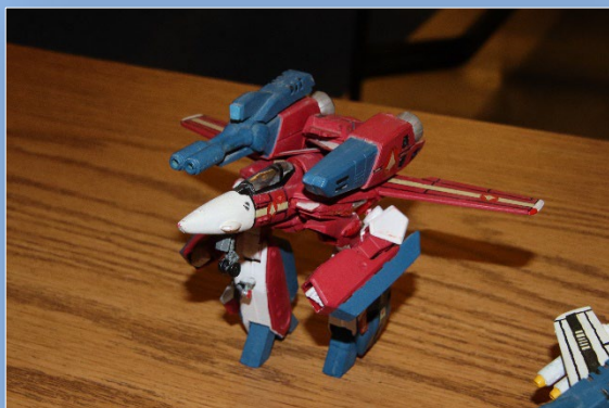
Some kind of space fighter