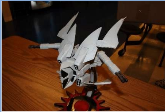
Special, 1 st Place Virago by Walter Schlueter