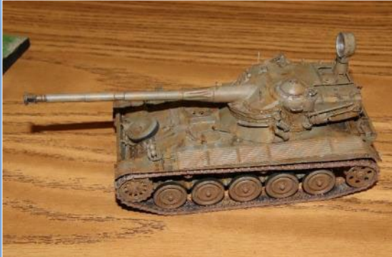
Military Vehicles 1/35, 2 nd Place AMX-13 by Jon DeSalva