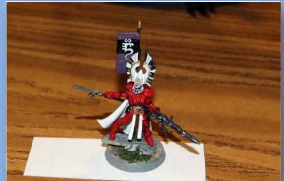
Figures, 2 nd Place Eldar Autarch by Tim Hosek