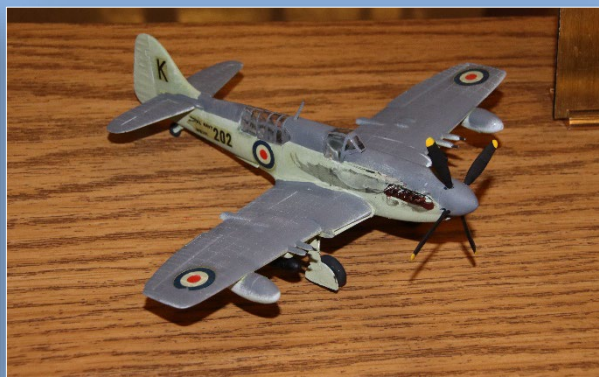
1/72 Firefly by Walter Schlueter